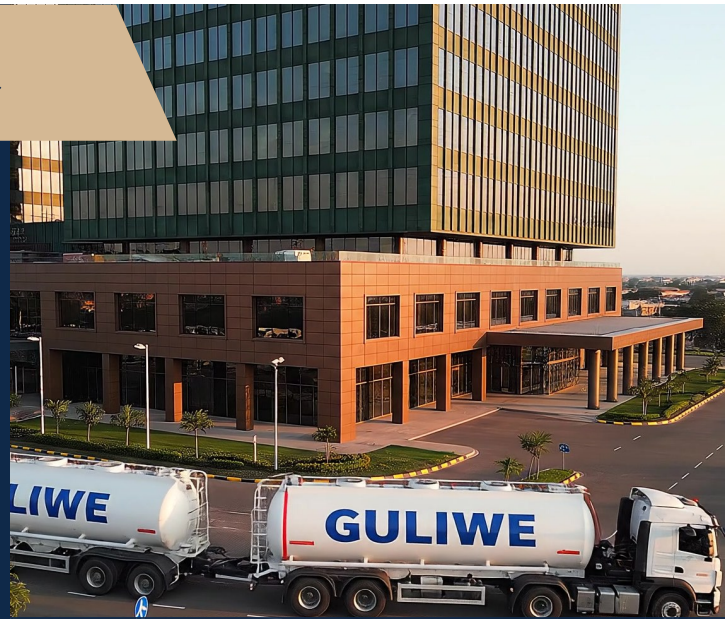
GULIWE INVEST HEADQUARTERS · SANDTON